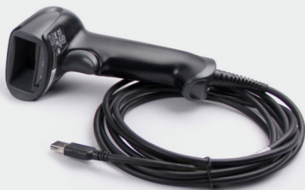
SMART TRACK Scanner