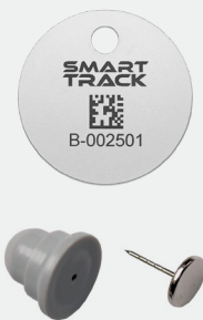
200 SMART TRACK 2D bar code tags with permanent security-style backing