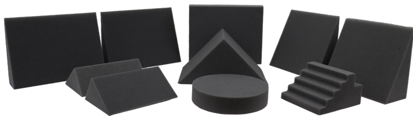
INF-17 Open Cell Foam