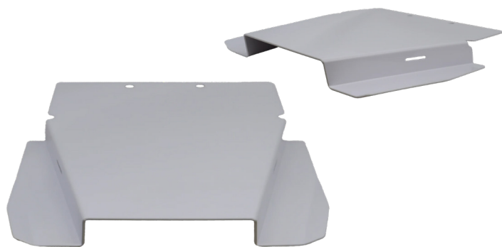
INF-263: Fits Canon CAT-850B angio table