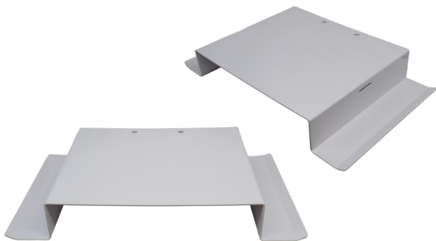
INF-262: Fits Siemens and Philips angio tables

INFAB's Rest Eazy Armboards are the perfect addition to your operating room. Our Armboards provide essential arm support for prone patients, ensuring proper patient positioning for radial and brachial access. Designed to be patient weighted, these Armboards slide over the head-end of the table, offering stability and easy of use. Constructed from lightweight and rigid ABS plastic, they are durable, reusable, and latex-free, making them safe for all patients. Available in four different part numbers to fit various Angio tables, these Armboards are a reliable choice for medical professionals.