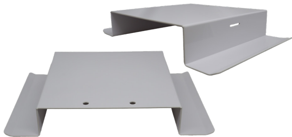
INF-265: Fits Canon CAT-880B angio table