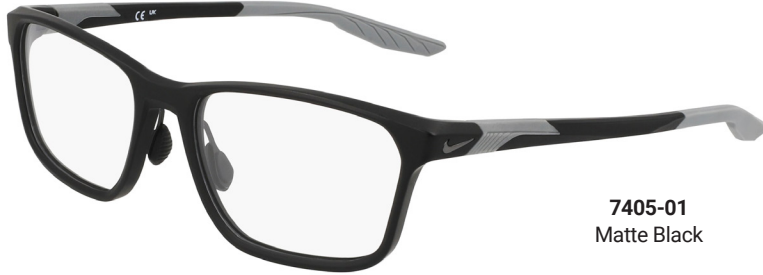
7405-01 Matte Black