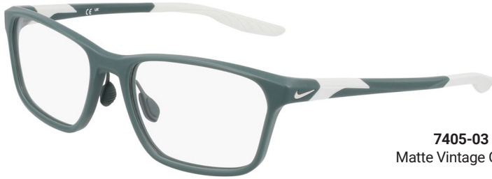
7405-03 Matte Vintage Green

The Nike 7405 INFAB radiation protection glasses offer a modern angular design with rubberized temple tips for secure fit, featuring 0.75mm lead equivalency lenses in a durable matte-finish frame for essential medical radiation protection.