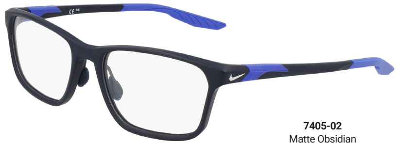
7405-02 Matte Obsidian