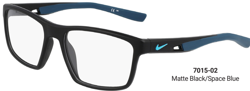
7015-02 Matte Black/Space Blue